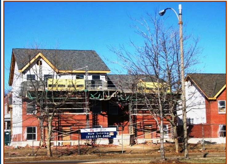
Frontal view of townhomes (from N. Kingshighway)

Completion of the Kingsway Townhomes is expected by April 2008. The two- and three-bedroom townhomes have generated widespread interest within the Kingsway West neighborhood as well as for motorists passing the construction project.