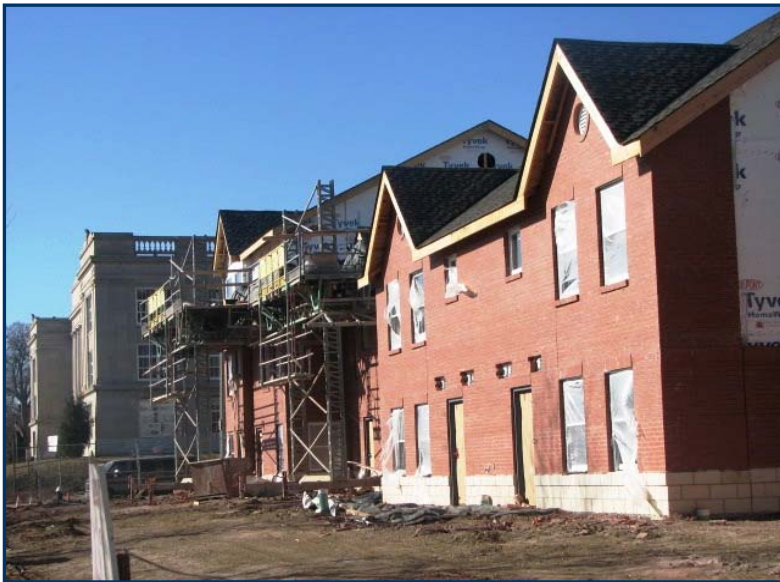
Kingsway Townhomes (close up from Wabada side)